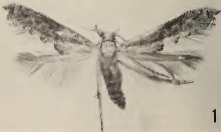
FIG. 1. Parochromolopis psittacanthus Heppner, n. sp., paratype ♀.

Description. Size, 4.0-4.6 mm forewing length. Head: fuscous, speckled with black and dull white. Labial palpus large, porrect, brown speckled with black and dull white, tufted dorsally on middle segment. Antenna with scape flattened, same coloration as head. Thorax: same coloration as head. Venter pale tan. Legs fuscous speckled with brown and tan. Forewing (Fig. 1) tan with black-tipped scales basally between veins and margins, as 4 tufts along dorsal margin, and inward by each tuft, and as 3 spots at mid-wing, end of cell, on distal \frac{1}{4} and subapically. Brown scales between black-tipped scales from mid-wing to apex. Venter fuscous. Hindwing gray fuscous;